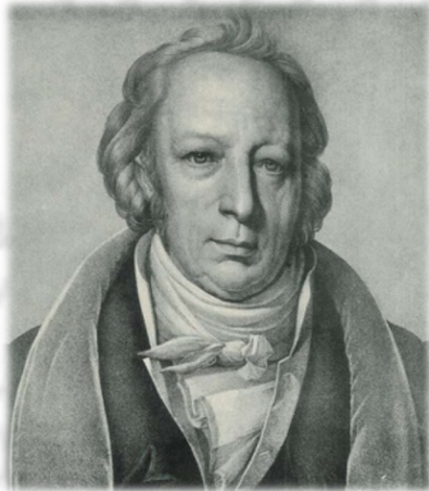
Friderich August Wolf (1759-1824)